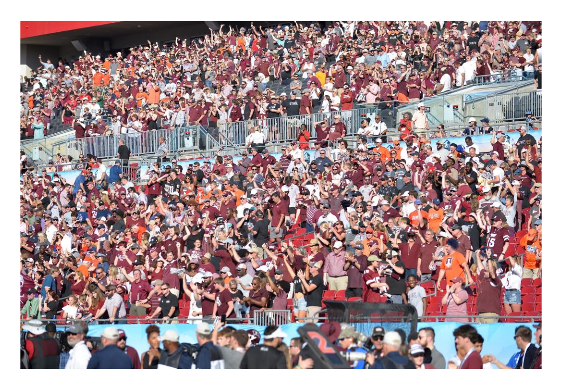
ReliaQuest Bowl Overview

The ReliaQuest Bowl has celebrated 38 years as one of the most respected college football bowls in the country. The game typically matches the two most popular conferences in college football , the Big Ten and Southeastern Conference along with the potential of either an ACC team or Notre Dame in select years. Fans from more than 40 states typically buy tickets to the Bowl each year and generate an annual economic impact of $30-$40 million for the Tampa Bay region. The bowl also creates tremendous national and international exposure while providing an exciting major sporting event for college football fans throughout the community. And as a 501(c) (3) tax-exempt organization the ReliaQuest Bowl has contributed more than $175 million to universities over its history. Finally, the ReliaQuest Bowl Charitable Giving Initiative distributes at least $500,000 each year to area charities currently totaling $4 million to more than 185 non-profits since 2016.