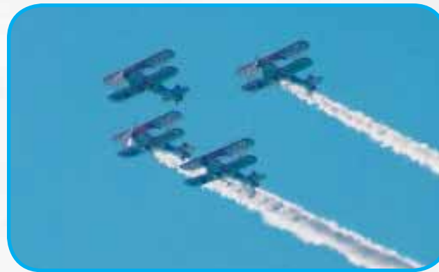
Convention & Visitor Bureau, the Hilton Clearwater Beach Resort and 93.3 FLZ FM radio.