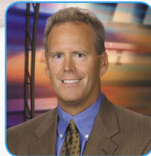
ESPN analyst Bob Davie will speak at this year's luncheon.

Bob Davie, a veteran college football coach of 25 years, most recently as head coach at the University of Notre Dame, primarily serves as the lead analyst on ESPN's Saturday noon telecasts, largely Big Ten games, with commentator Mark Jones and reporter Holly Rowe. He also makes occasional appearances on ESPN College GameDay programs. Bob and his team also handled the broadcast of last years Outback Bowl.